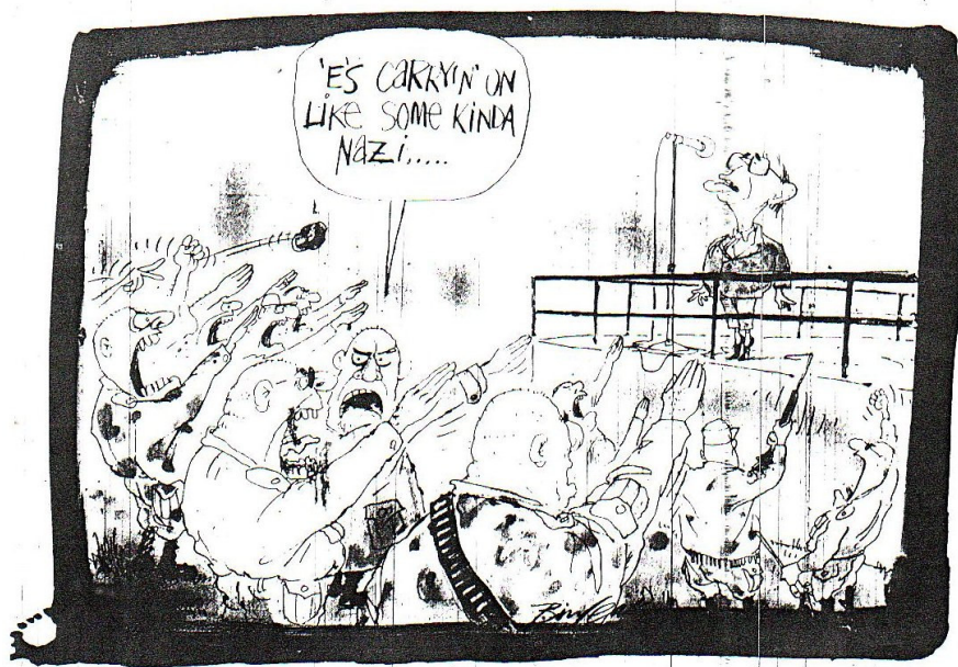
Cartoon published in The Australian on June 17 th 1996.

Newspaper cartoonists in Australia have a long and honourable history but they have displayed a sense of narrow-minded intolerance during the so-called ‘gun debate’ that